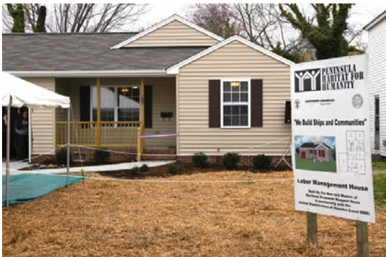
Labor Management House 2