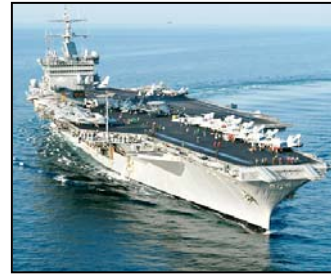
USS Enterprise (CVN 65) arrives at the shipyard this week for approximately nine months of maintenance work.