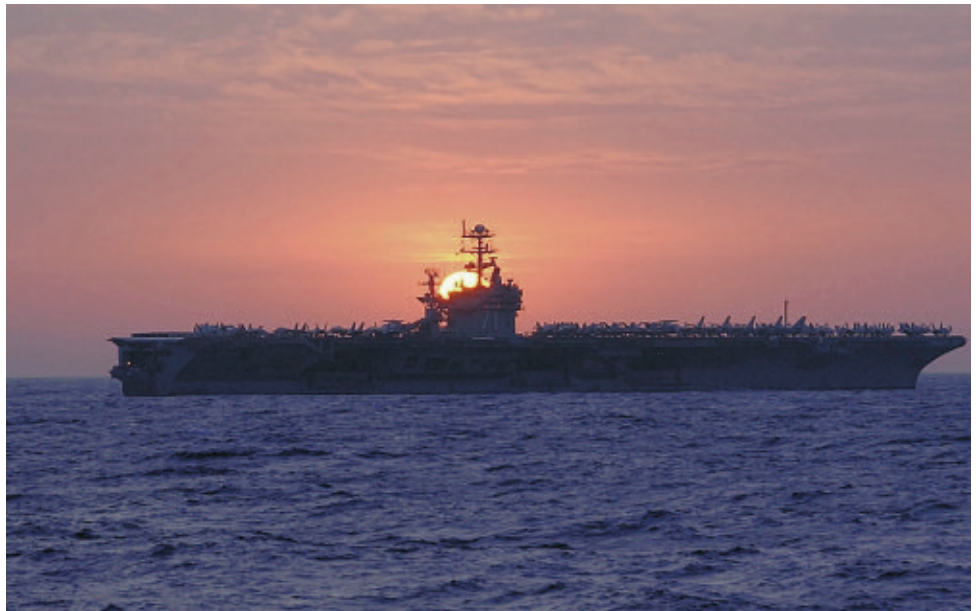
USS Theodore Roosevelt (CVN 71) is the fourth Nimitz -class carrier built by Newport News. The carrier is scheduled to arrive at the shipyard in 2009.